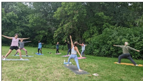
Figure 7: Yoga in the Parks class at Locke Park in Fridley. Practicing physical exercise in a natural setting can reduce stress and increase a positive sense of wellbeing.

began, Master Gardeners shared information and experiences on the mental and physical healing benefits of gardening and caring for plants.