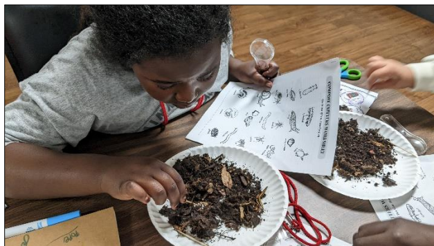
Figure 9: A Northgate Woods summer program participant examines a compost sample and identifies micro- and macro-organisms.