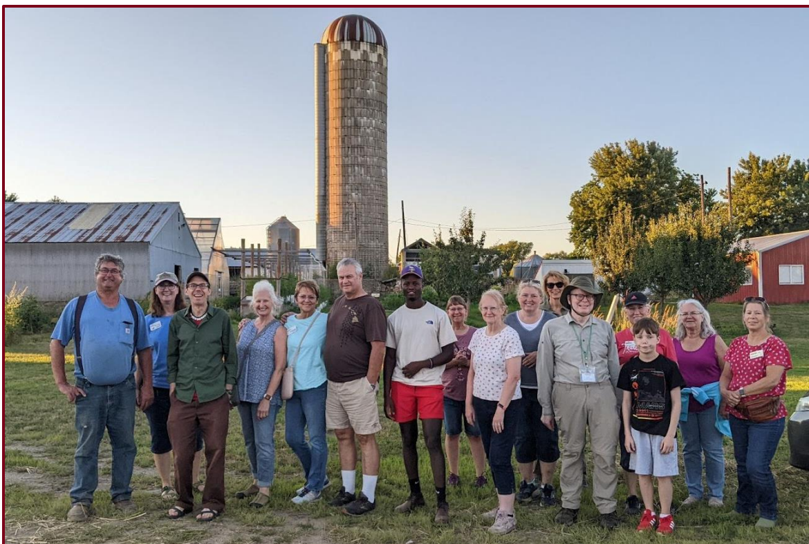
Figure 1: Anoka County Master Gardeners tour All Good Organics Farm in Lino Lakes. All Good Organics was awarded Farm Family of the Year in Anoka County in 2022.