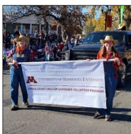
Figure 10: Anoka County Master Gardeners and prize-winning float at the Anoka Halloween Parade.