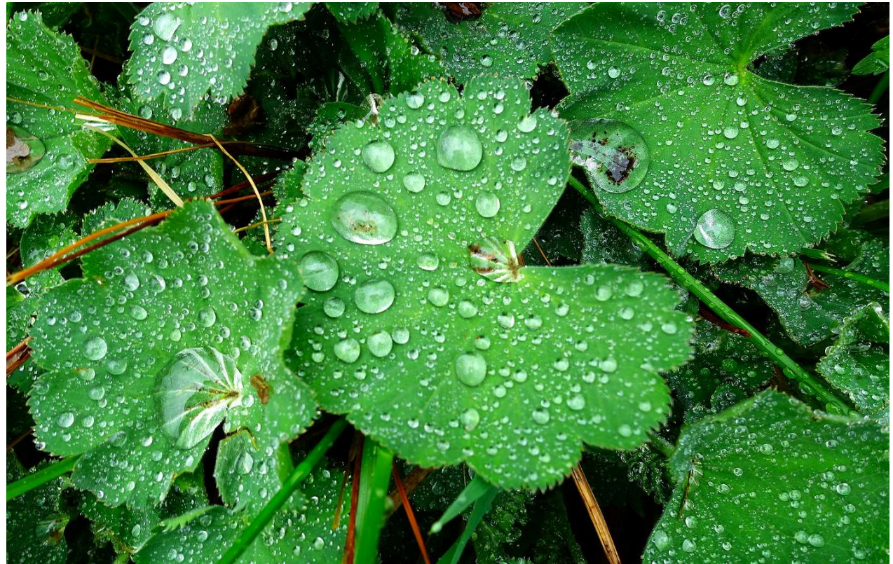
IMAGE FROM GERTRUD KLOPP FROM Lady's Mantle in the Spring Rain | Gertrud Klopp | Flickr

Remove spent flower stems to prevent self-seeding