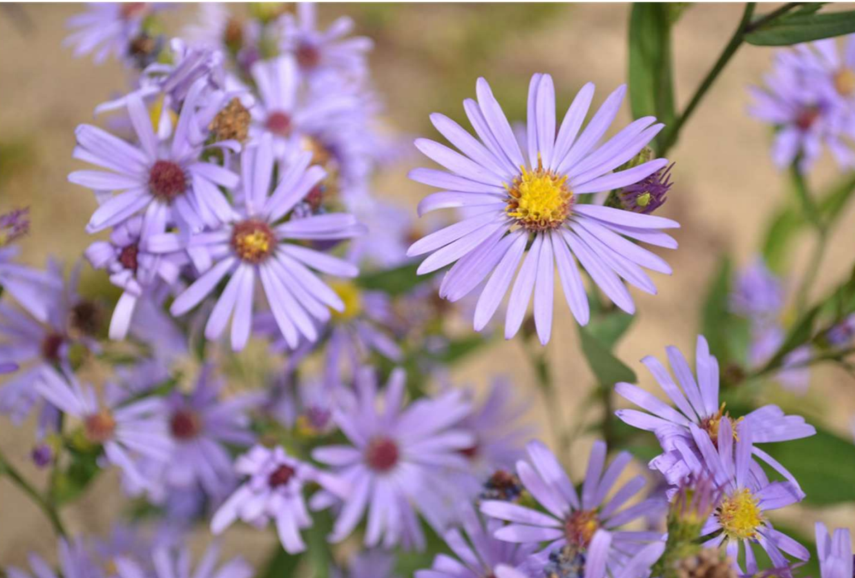
IMAGE FROM BROOKLYN BOTANIC GARDEN FROM Aromatic Aster | Symphyotrichum oblongifolium 'October Skies... | Flicki