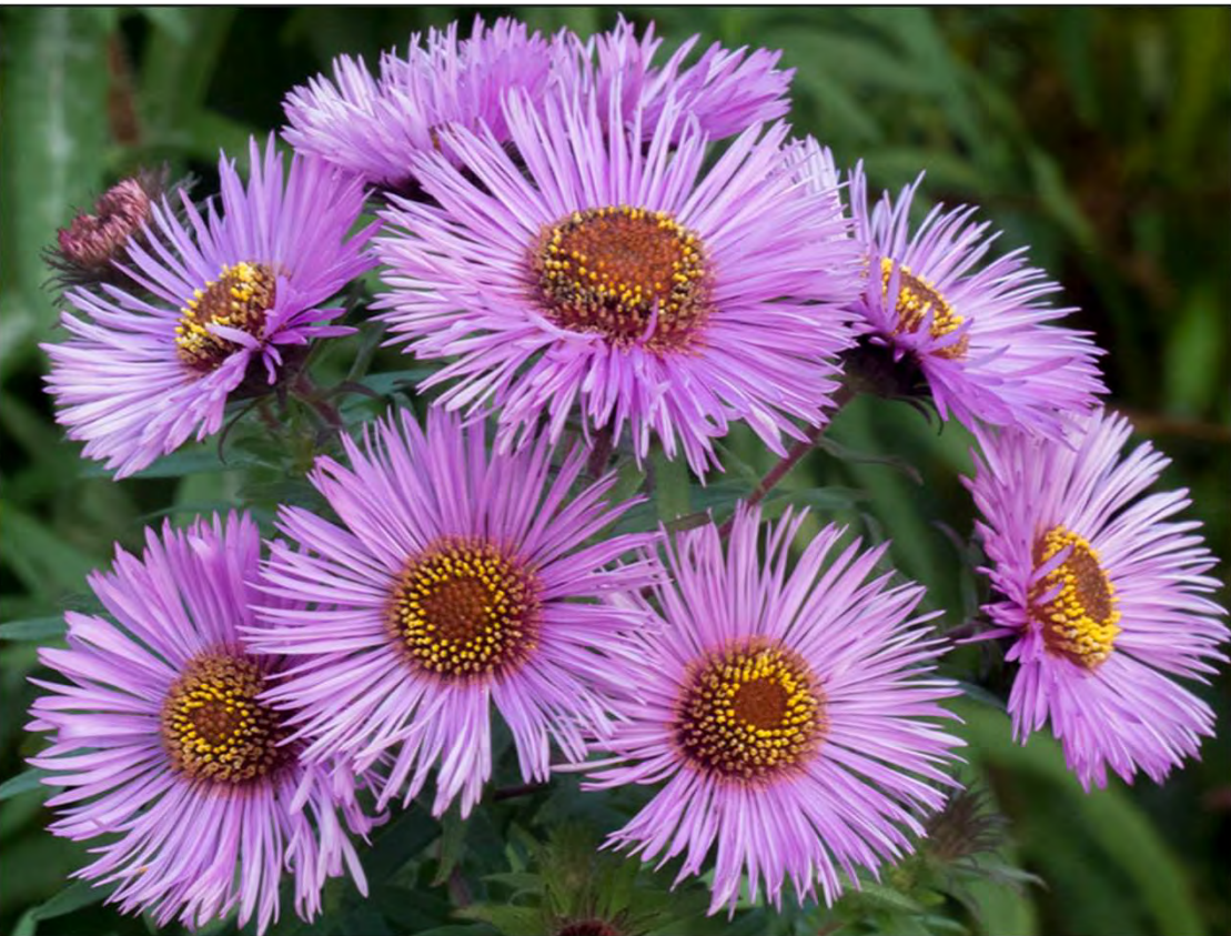
IMAGE FROM PRISCILLA BURCHER FROM New England aster | Symphyotrichum novae-angliae (New Englan... | Flickr