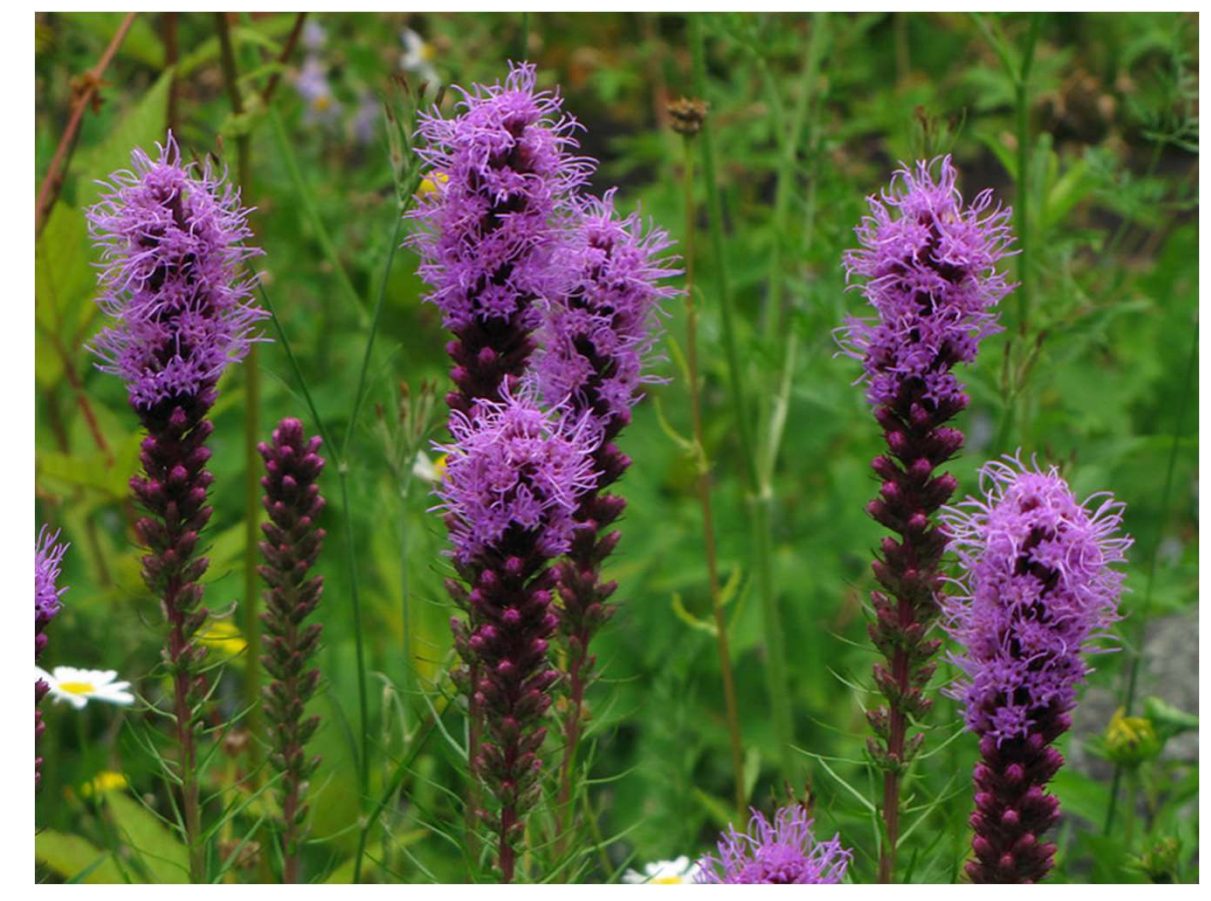
IMAGE FROM Blazing Star | Liatris blooming at the Daniel Boone Native G...